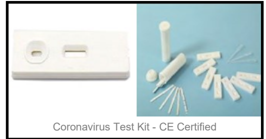
Coronavirus Test Kit - CE Certified