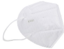
US FDA Certified N95 & KN95 Available