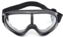
US FDA Certified