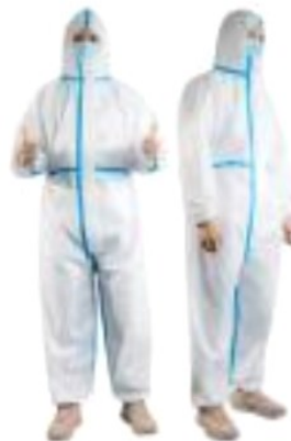
EN14126-2003/ANSI/AAMI PB70-2012/NFPA 1999