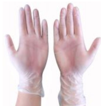
US FDA Certified