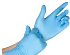
US FDA Certified