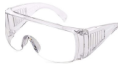
US FDA Certified