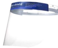
US FDA Certified