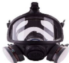
US FDA Certified